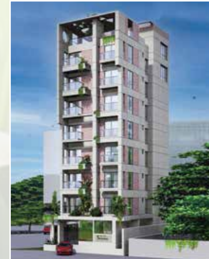
BEST-TECH Snowdrop Sector - 15, Uttara, Dhaka