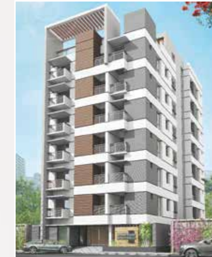
BEST-TECH Shomota Bhaban Shanti Company Road, Barahipur, Feni