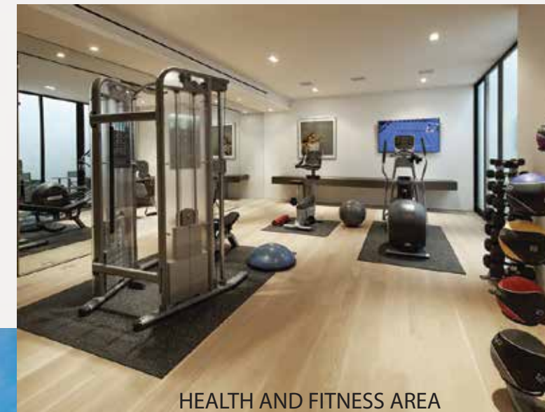
HEALTH AND FITNESS AREA

LUXURY APARTMENT IN BEST-TECH LILLY UNIQUELY CRAFTED TO SUIT YOUR NEEDS.