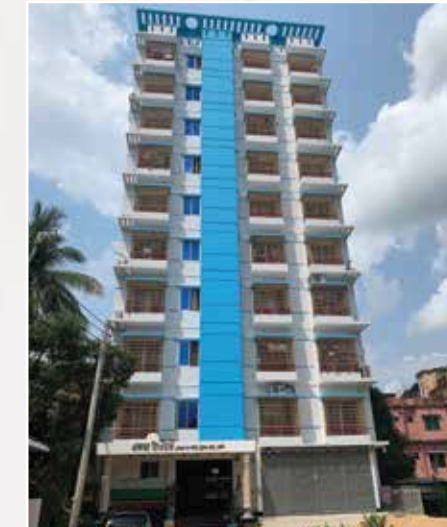
BEST-TECH Ekota Tower Cumilla Bus Stand, Trunk Road, Feni