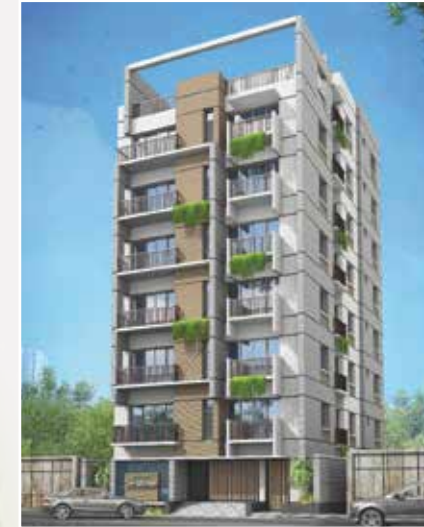
BEST-TECH The Alliance Barahipur, Feni