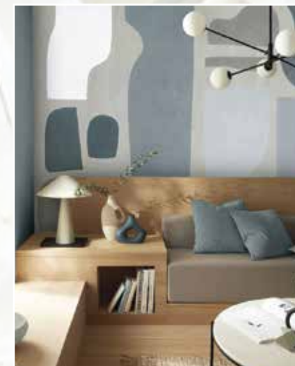
BEST-TECH Blue Bell Sector - 4, Uttara, Dhaka